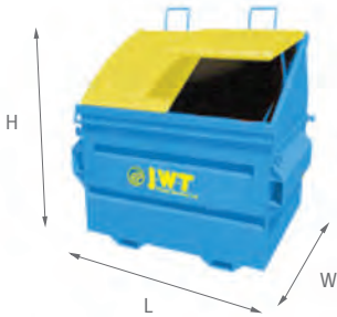
8 cu yd container