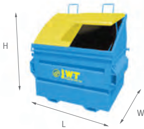
6 cu yd container