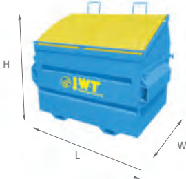
4 cu yd container