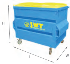
2 cu yd container