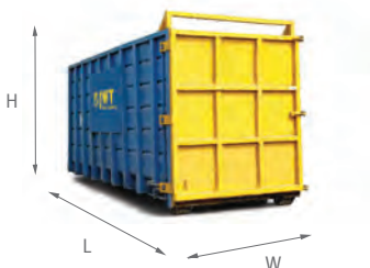
40 cu yd open container