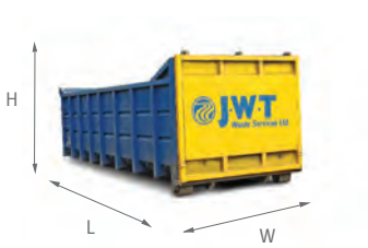
25 cu yd open container