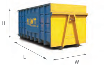
35 cu yd open container